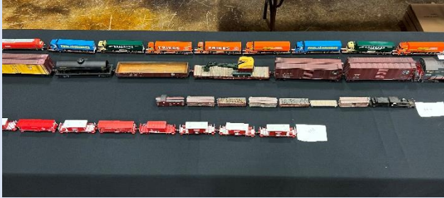
Complete Train Entries