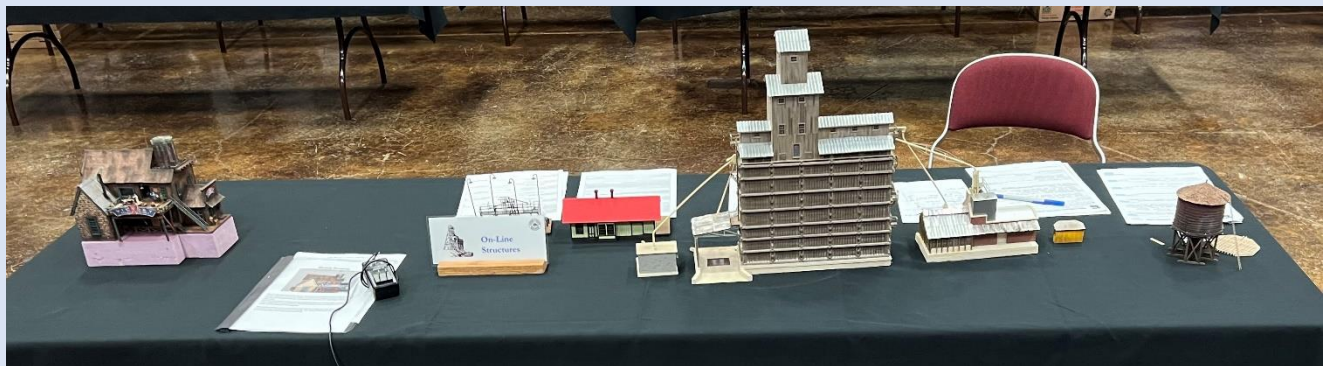
On Line Structures