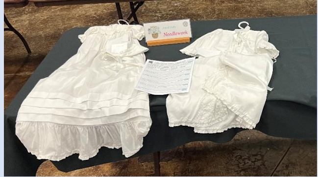
Arts & Crafts - Needlework