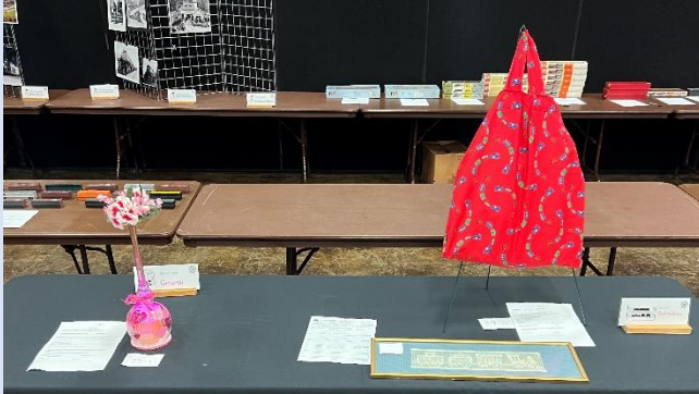
Arts & Crafts – General & Railroadians