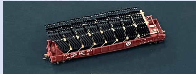
Freight Car Entry